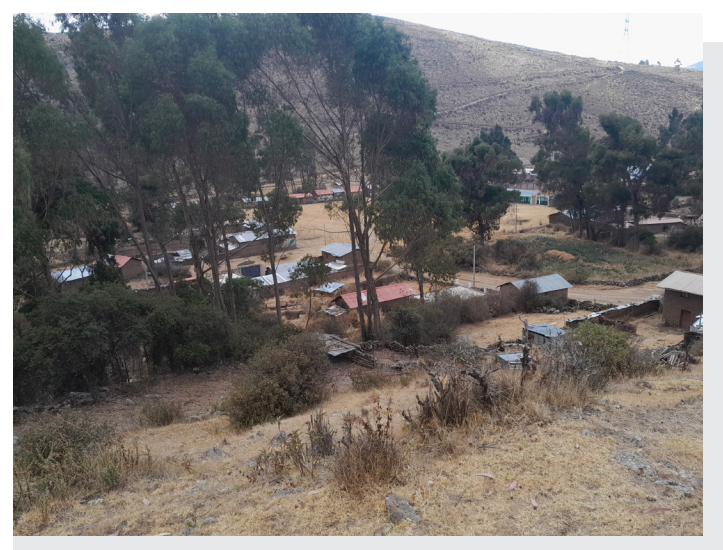
San Antonio de Montecucho: The water project will begin construction in this farming community in June 2024.

To celebrate such great accomplishments, Alas and each participating community put significant effort into the inaugurations of the new water systems. The festivities are attended by representatives from Alas , who are sometimes accompanied by donors from North America. Community members dressed in traditional costumes give thank you speeches and perform ceremonial dances before everyone sits down to a celebratory meal cooked by the villagers.